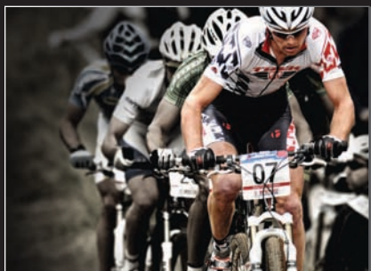
/ XC RACE