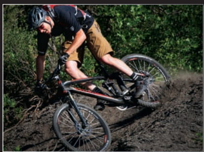
/ SINGLETRACK TRAIL

Trek Mountain bikes are the most technologically advanced on the market. Each platform leads its class, and every model is loaded with features and details that will make any ride, on any trail, better.