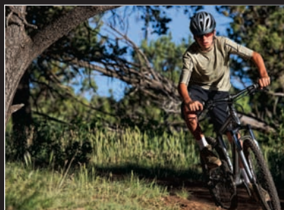
/ SPORT HARDTAILS

Top Fuel / XC Full Suspension 29ers / 9 Series 8 Series / 6 Series / 29er Hardtails