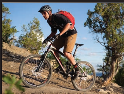
/ TECH TRAIL